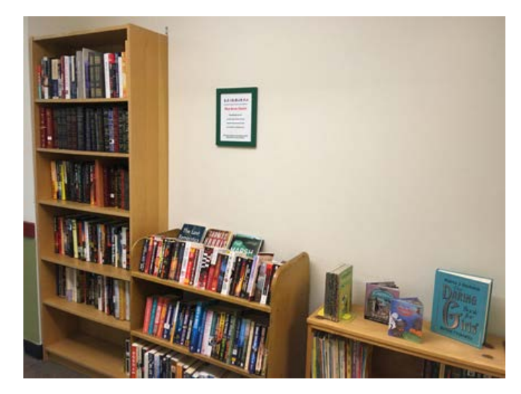
The Mini Book Chalet opposite the copier

All is well at the Mammoth Lakes Library! We are really looking forward to being able to meet in person soon and, eventually, to be able to present programs at the Library!