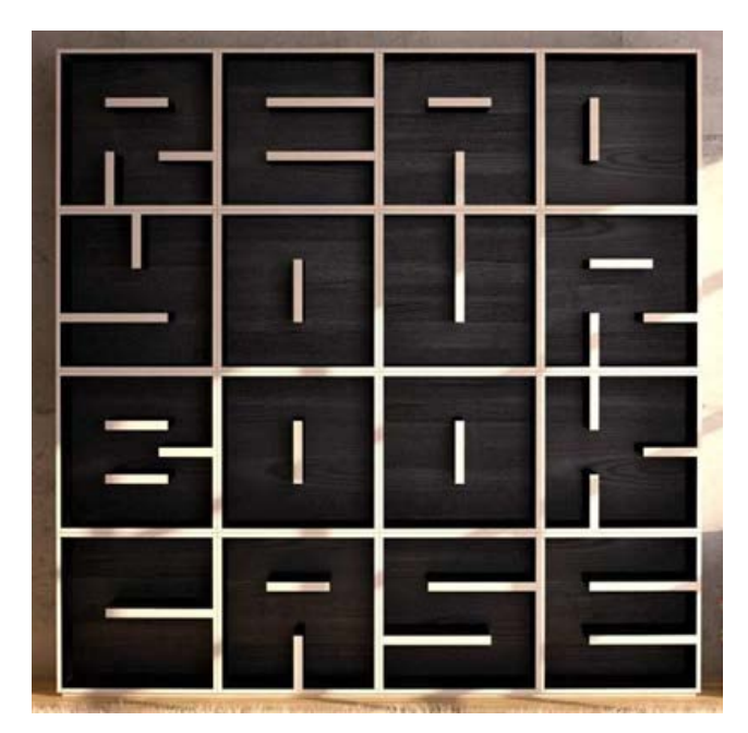
What does this say? Not certain? See answer later in this newsletter.