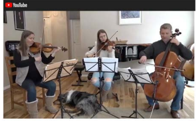
Musical Story Hour - Meet the Music Makers

Meet the Music Makers (all grades including pre-school)