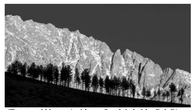
'Trees and Mountains' (near South Lake) by Bob Rice

The gallery walls are located in the Ellie Randol Reading Room during regular library hours.