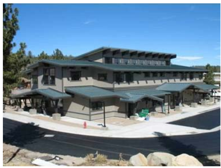
Mammoth Lakes Library from up the hill at the Mono County Office of Education parking lot

Watch for your MLFOL membership renewal notice in September.