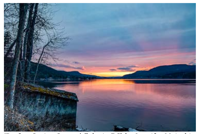
'Perfect Spring Sunset' (lake in BC) by Jennifer Majeski

Additionally, the photographers will have a special sale day for additional framed and unframed prints on <u>Saturday</u>, <u>September 10^{th} , 12:00 - 4:00 <u>PM</u>.</u>